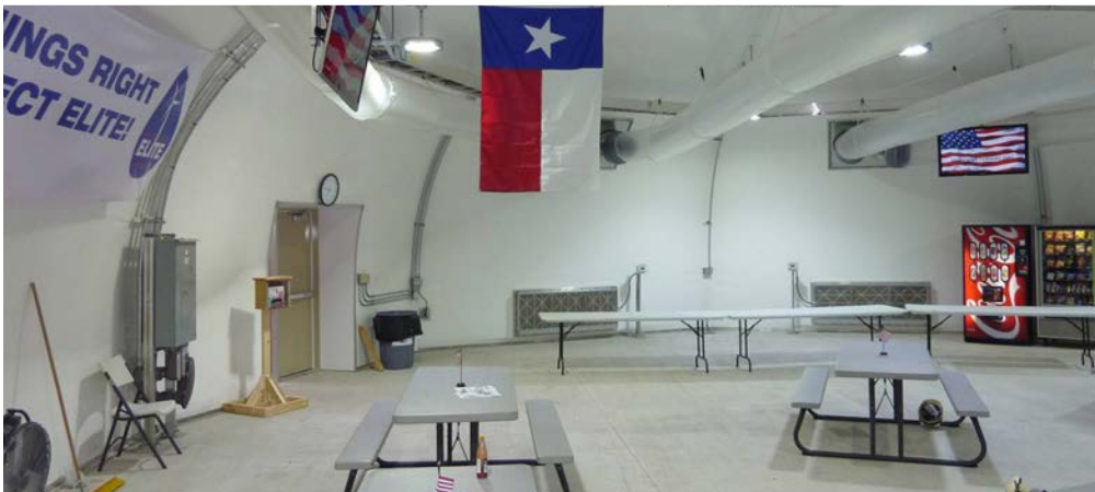
Exxon Mobil Chemical Baytown Texas Refinery

50' x 100' Includes 8" R28 fiberglass blanket insulation and designed to meet 110 mph wind loads.