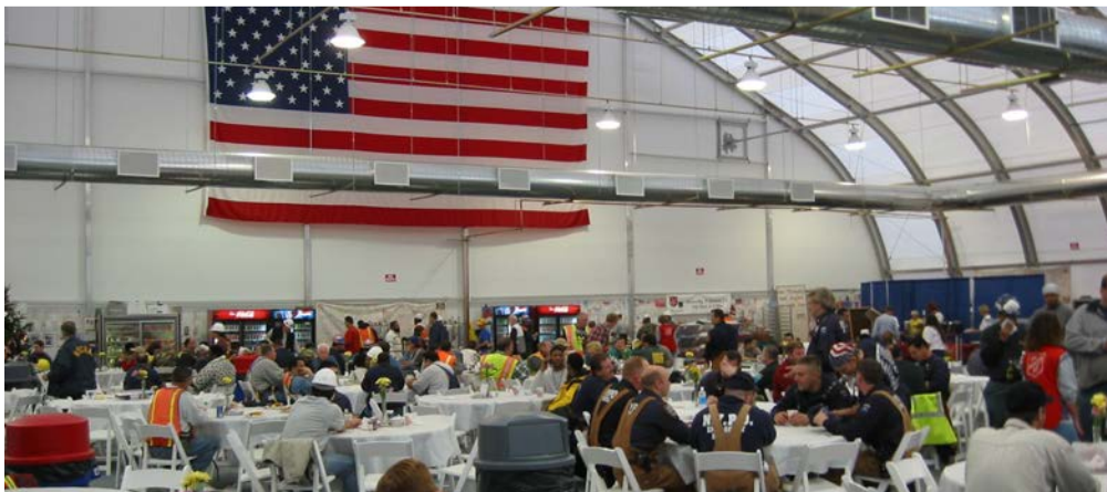
Ground Zero - 911 New York, New York

120' x 260' Thousands of recovery workers at ground zero utilized this Sprung structure as a dining, wash and rest area facility