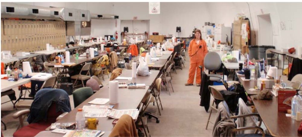
Conoco Phillips Roxana, Illinois

40' x 100' Includes 8" R28 fiberglass blanket insulation