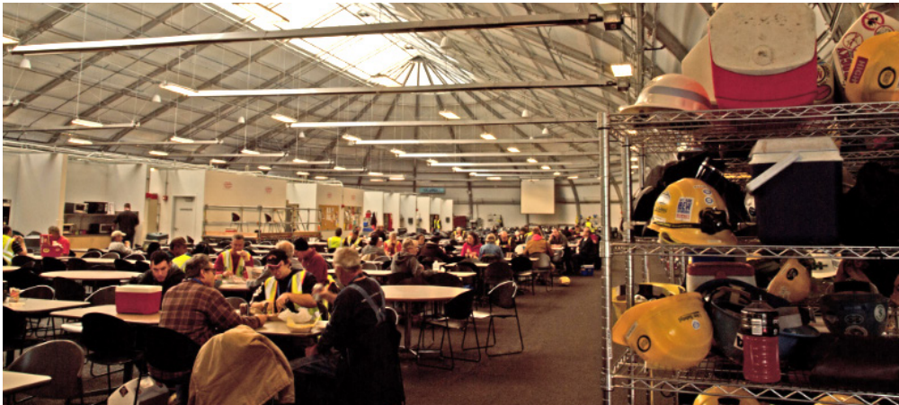
Intel Hillsboro, Oregon